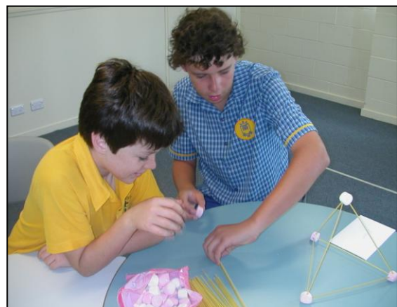
Developing skills and understandings through hands-on learning at a 5energies® learning session