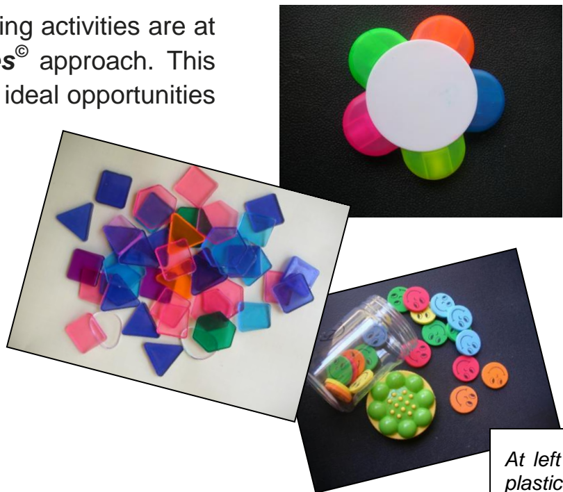
At left (top to bottom): Petal highlighter pen, plastic mosaic tiles and jars of smiley faces